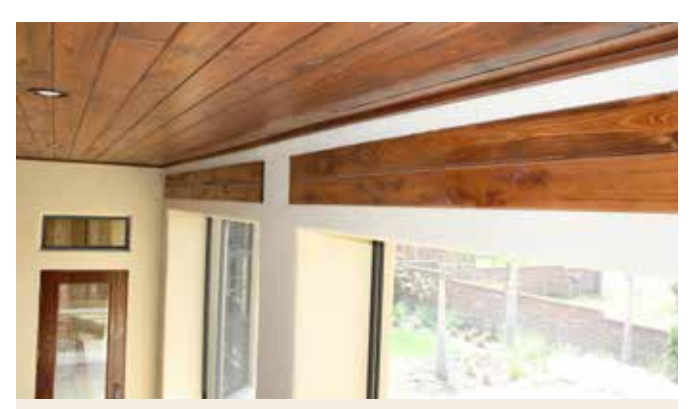
Removable front access panels finished to complement wooden tongue and groove ceiling.