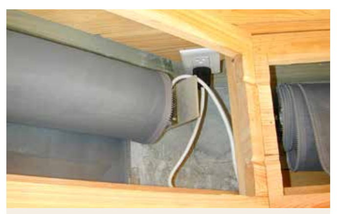
Duplex electrical outlet installed inside the cavity outside the working area of the screen roller, mesh and motor.