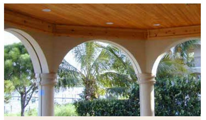
Motorized screens recessed within multiple arched openings, with removable front access panels.

Recessed units are most commonly installed during a new construction project or a major remodel. The main appeal of recessing motorized screens is to hide the mechanics and side tracks without affecting the architectural aesthetics of the building. In most custom homes, it is the preferred installation choice of both the client and architect.