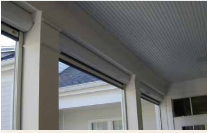
Standard mount motorized screens with housings and standard tracks. Under header mount.