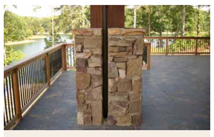
U-channel installed within a mixed column of wood and stone.