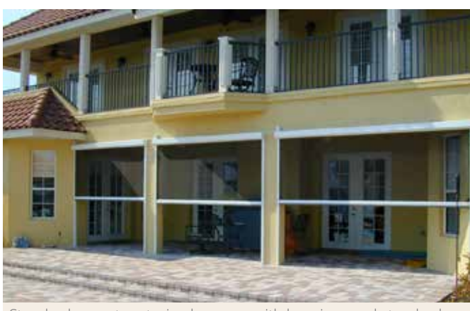
Standard mount motorized screens with housings and standard tracks. Outside above header mount.