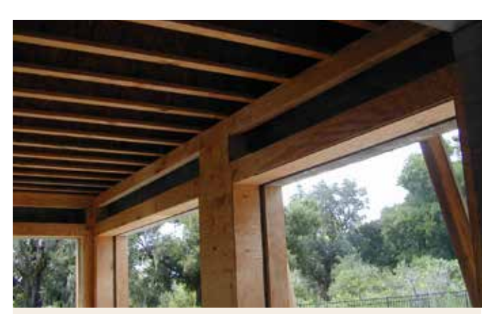
Cavity framed in top of header opening with front access. U-channel mounted in columns surrounded by framing before stucco finish is applied