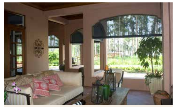
Arched openings with 80% sun block to control UV rays and temperature create a more livable outdoor space.