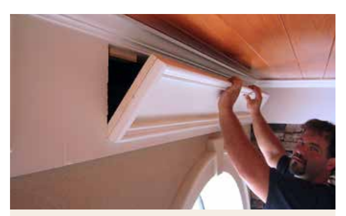
Customized for your home, motorized screens are integrated for long term use and easy maintenance.