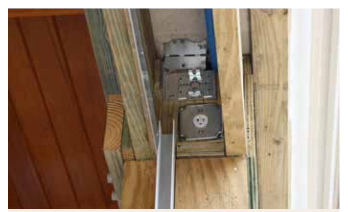
Unfinished cavity and column showing mounting brackets, electrical connections, and u-channel placement.