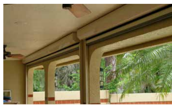
Standard mount motorized screens with housings and standard tracks. Inside above header mount.