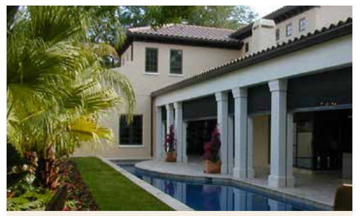
Recessed mount motorized screens built into cavities with recessed U-channel in decorative columns.